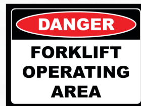
FORKLIFT AREA TSA-CPS-801