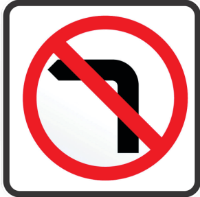
NO LEFT TURN TSA-CPS-501