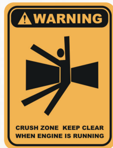
CRUSH ZONE TSA-CPS-800