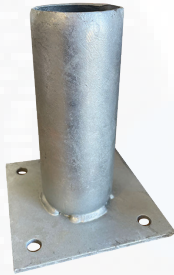
SIGN POST BASE