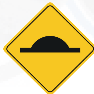
SPEED BUMP TSA-CPS-301