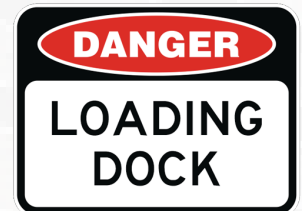
LOADING DOCK TSA-CPS-802