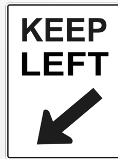
KEEP LEFT TSA-CPS-505