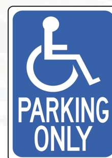
DISABLED PARKING TSA-CPS-404