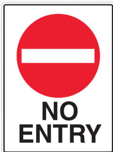
NO ENTRY RED TSA-CPS-513