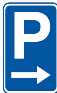
PARKING RIGHT TSA-CPS-403