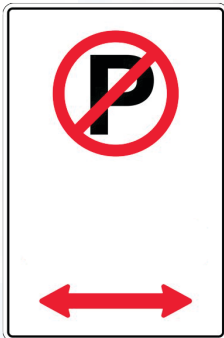
NO PARKING TSA-CPS-405