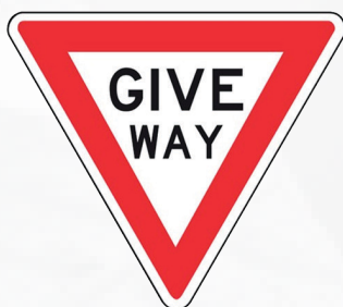
GIVE WAY TSA-CPS-102