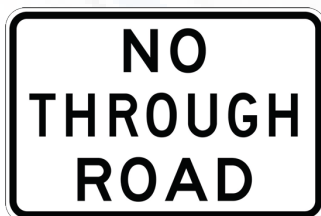
NO THROUGH ROAD TSA-CPS-516