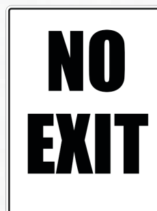
NO EXIT TSA-CPS-515