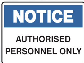
NOTICE - AUTH ONLY TSA-CPS-407