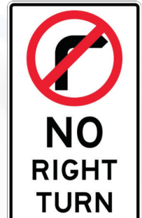
NO RIGHT TURN TSA-CPS-504