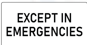
EXCEPT EMERGENCIES TSA-CPS-803