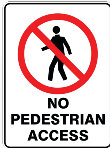
NO PED ACCESS TSA-CPS-204