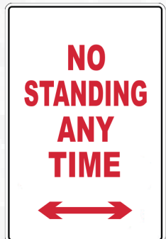
NO STANDING TSA-CPS-406