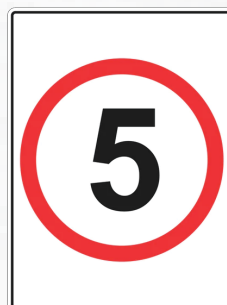
5KM SPEED TSA-CPS-601