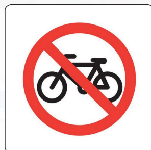
BICYCLES PROHIBITED TSA-CPS-701