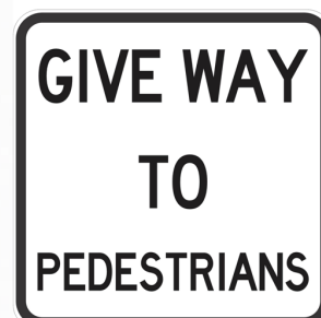
GIVE WAY TO PEDS TSA-CPS-203