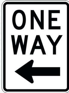
ONE WAY LEFT TSA-CPS-507