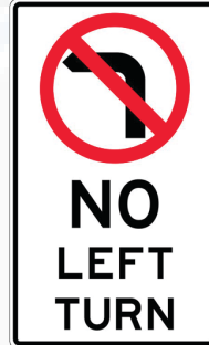
NO LEFT TURN TSA-CPS-503