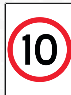
10KM SPEED TSA-CPS-602