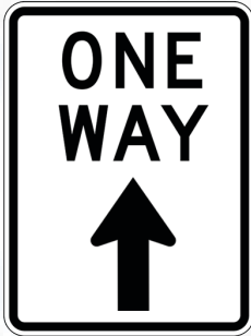
ONE WAY TSA-CPS-508