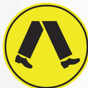
PEDESTRIAN CROSSING TSA-CPS-201