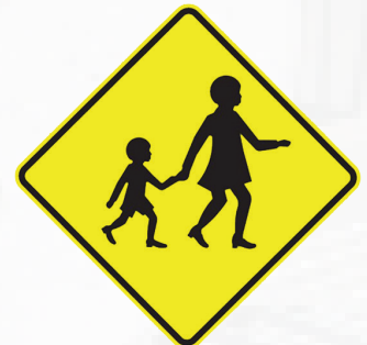
CHILDREN CROSSING TSA-CPS-202