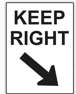
KEEP RIGHT TSA-CPS-506