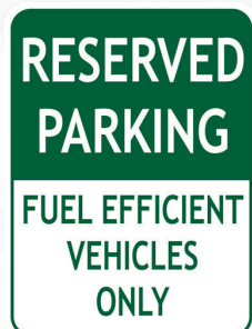
RESERVED PARKING TSA-RPFEV