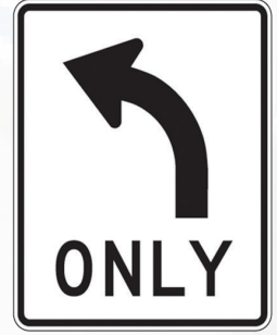
LEFT TURN ONLY TSA-CPS-512