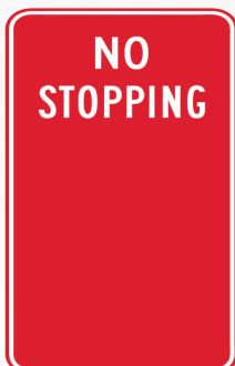
NO STOPPING TSA-CPS-407