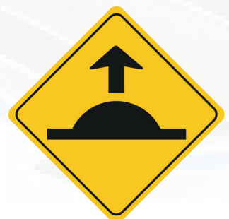
SPEED BUMP AHEAD TSA-CPS-302