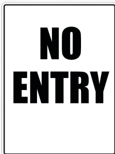
NO ENTRY TSA-CPS-514