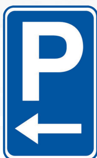
PARKING LEFT TSA-CPS-402