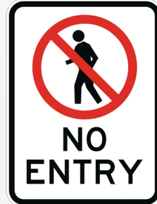
NO ENTRY TSA-CPS-205