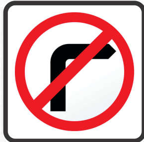
NO RIGHT TURN TSA-CPS-502